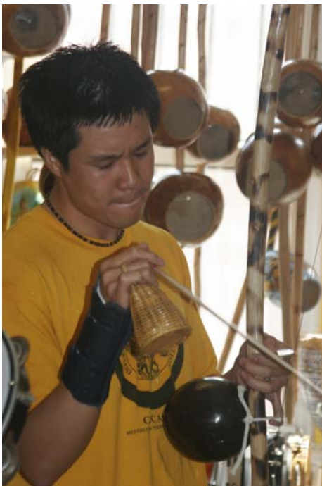
Berimabu practice at ICAF