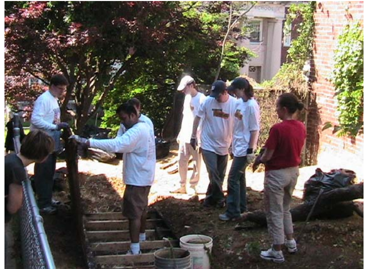
Greater DC Cares give ECAC a makeover

cent Orange who seemed impressed with our progress.